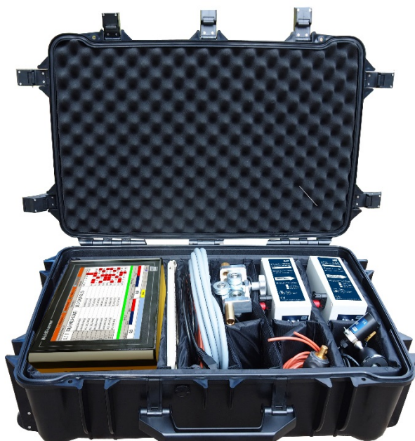
WeldScanner Validator with Transport Case (Full Package)

The WeldScanner Validator can validate all brands of welding equipment in accordance with the European Standard EN 50504 - Validation of Arc Welding Equipment. It also offers the same full level of functionality as the WeldScanner.